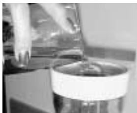
Figure 17 Wet glass sleeve